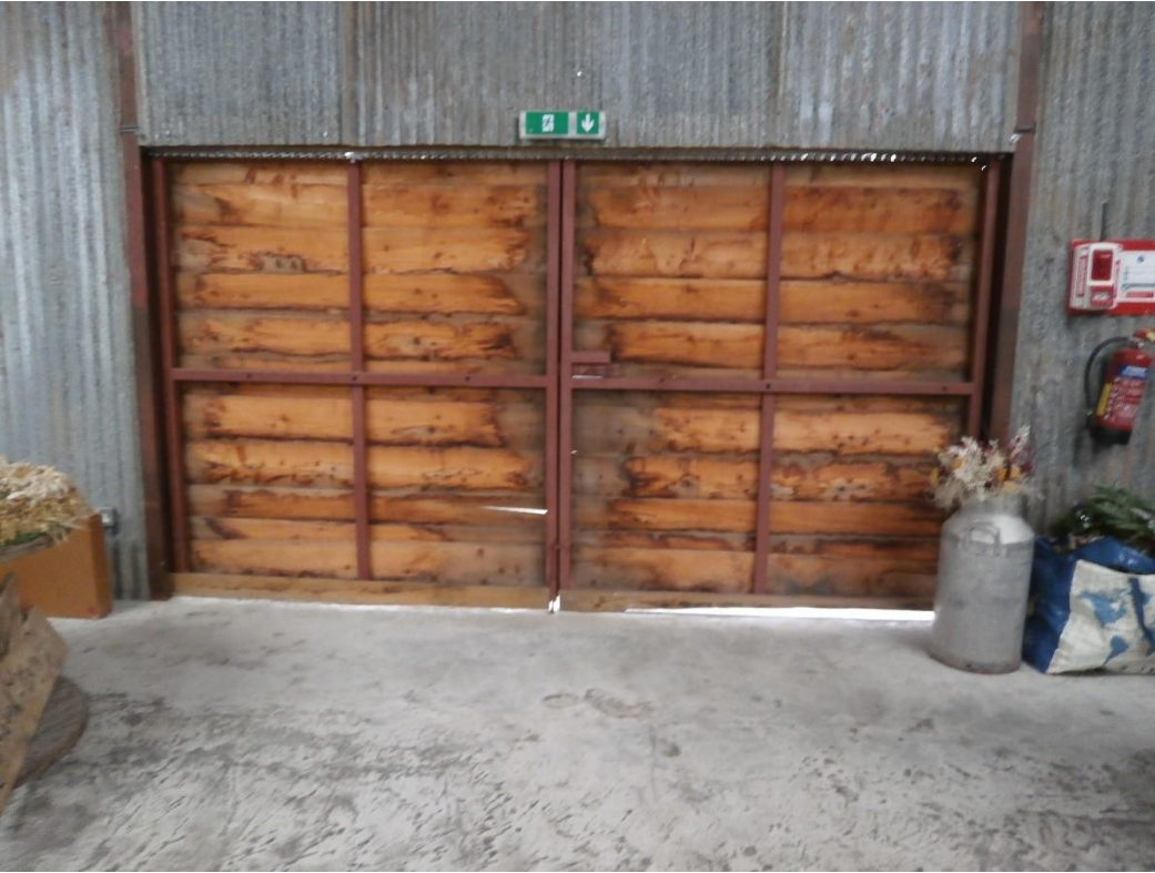
Figure 5 Large front wooden door with gaps that could lead to sound leakage