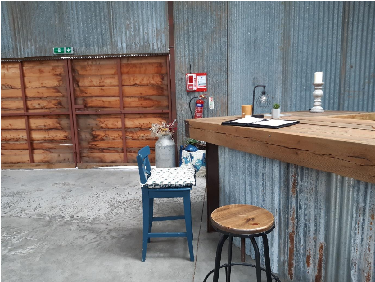
Figure 8 Bar near the front entrance, next to the dance floor area