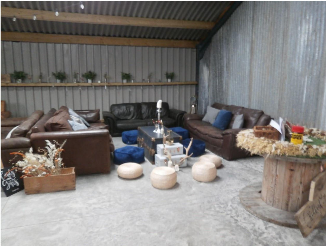
Figure 7 Barn structure interior, metal sheet cladding material laying on top of a wooden frame. Sitting area at the front of the building, next to the dance floor.