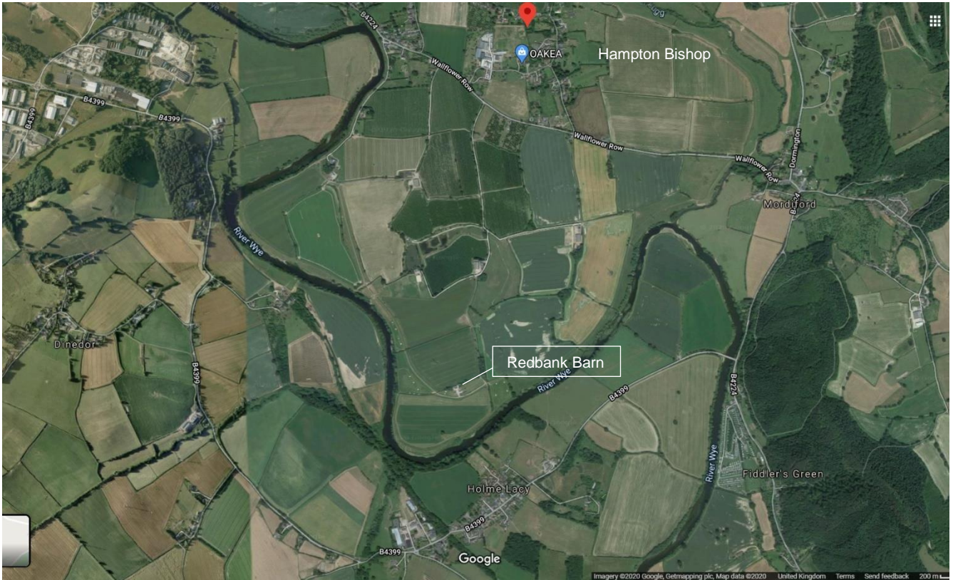
Figure 2 Redbank Barn is situated at the South side of Hampton Bishop, North of Holme Lacy with the River Wye in between.