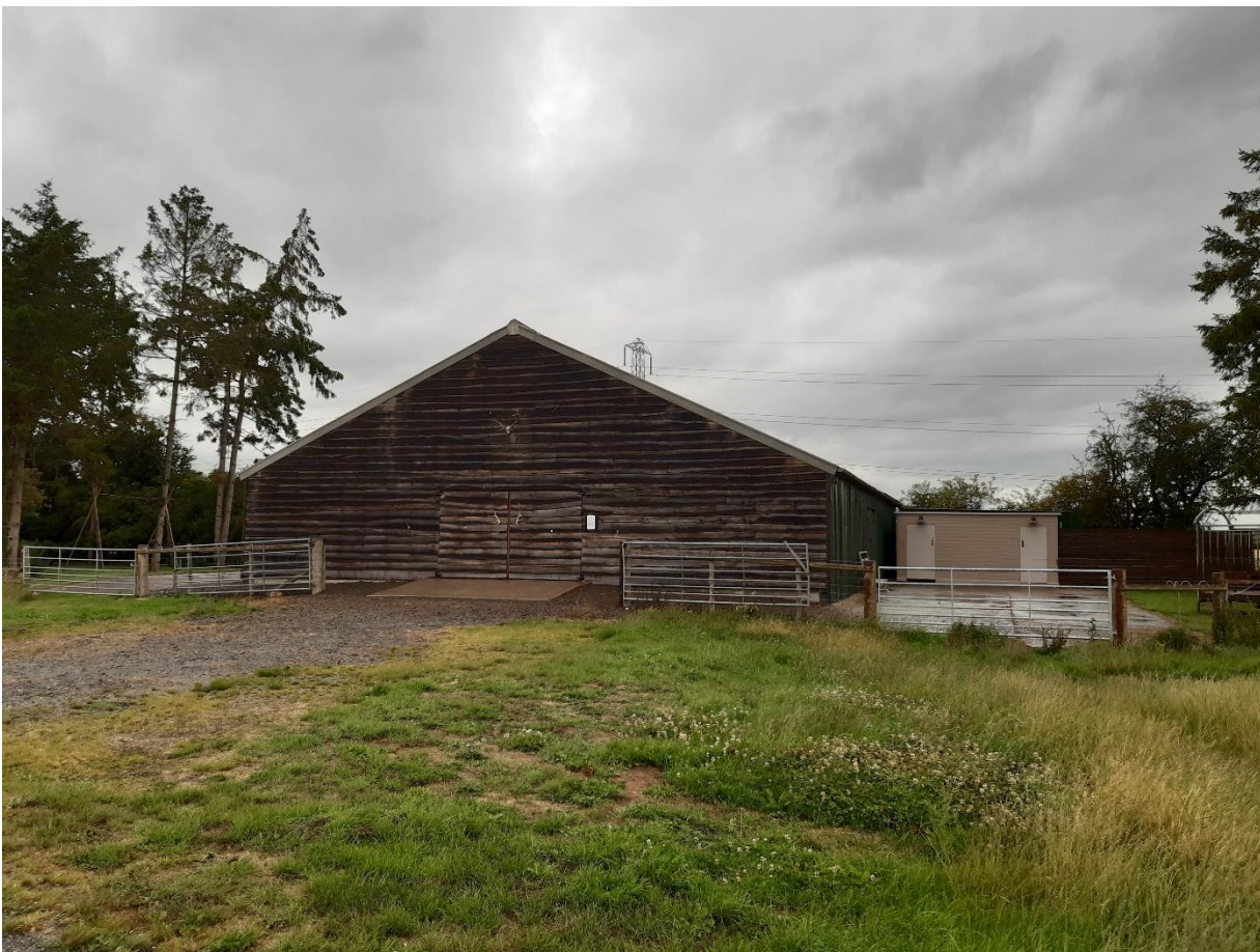
Figure 4 Front of the barn view from the outside, with large double door in the middle and toilets to the right.

The main entrance to the premises was detailed as the large double doors to the south side, which face in the direction of the properties at Holme Lacy. There are also two smaller side doors to the west and east side of the building allow access to the outside. There a gaps on the front door which would allow sound to leak from within the premises. The roof and walls of the premises are of a poor sound attenuation properties with the doors closed and further significant reduction with the doors open. Music events of this nature usually operate between 80 -95dB in the entertainment area and crown noise can further increase these noise levels (especially in wedding events). Due to the rural location of this venue the back-ground levels will be very low (below 30dB) and the noise will carry over large distances due to few structures in its pathway to absorb the sound.