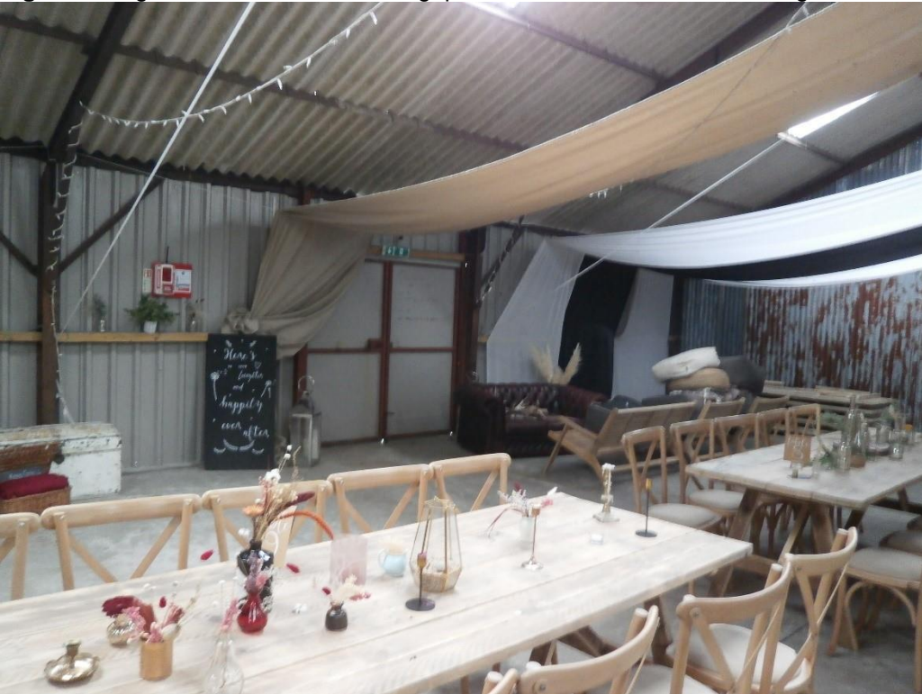
Figure 6 Left rear side door