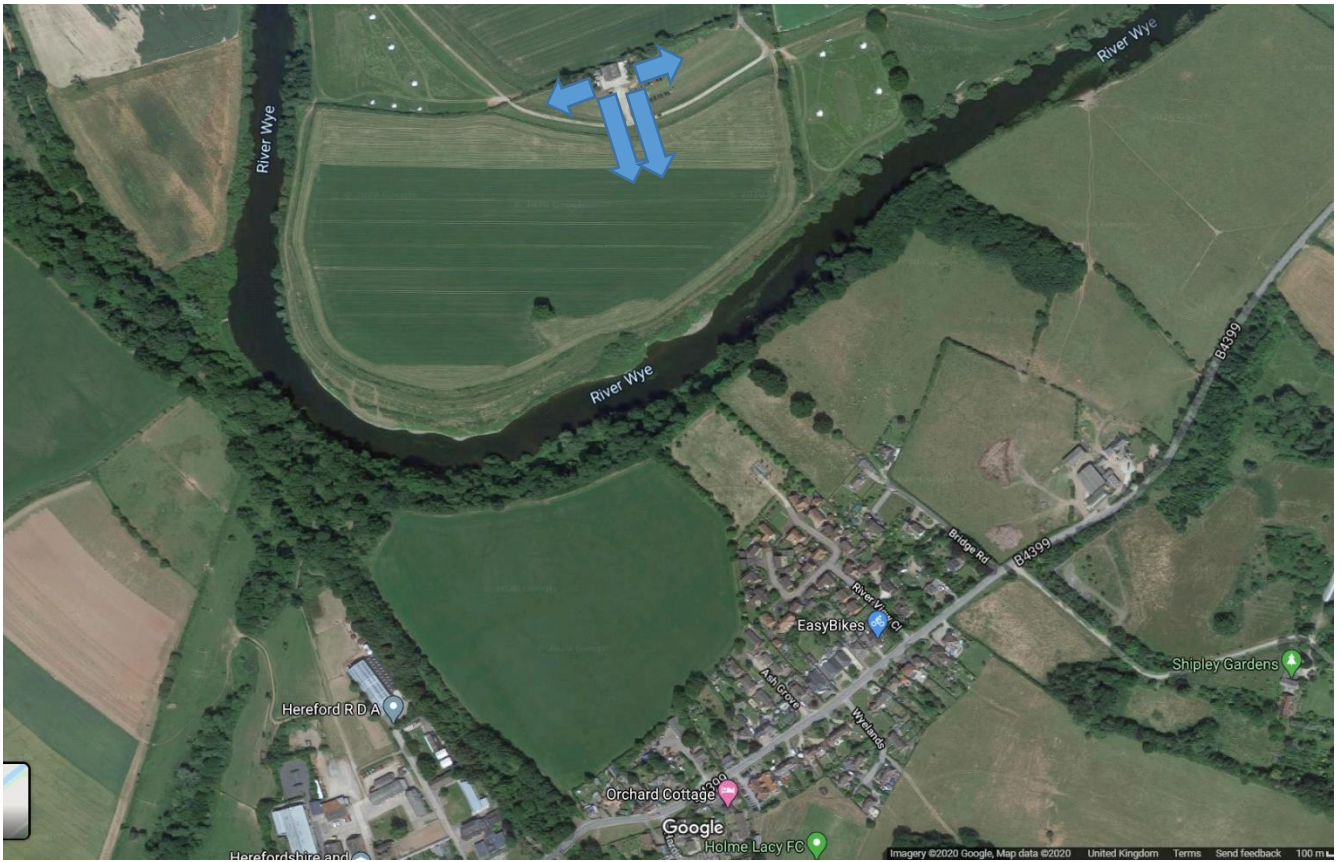
Figure 1 Large double door to the front of the building is directly facing the residential properties at Holme Lacy. Two smaller doors to the rear sides of the premises